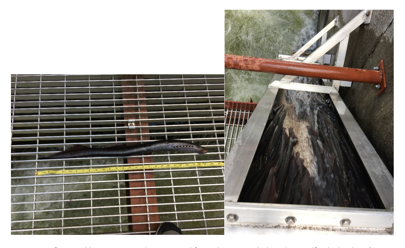
Figure 1. Left - Dried lamprey mortality removed from the grating below the Bradford Island LPS's east entrance. Right – Bradford Island's east entrance ramp with several lamprey attempting to ascend.